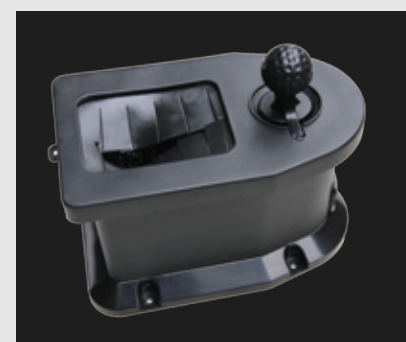
Ball Washer (Optional)