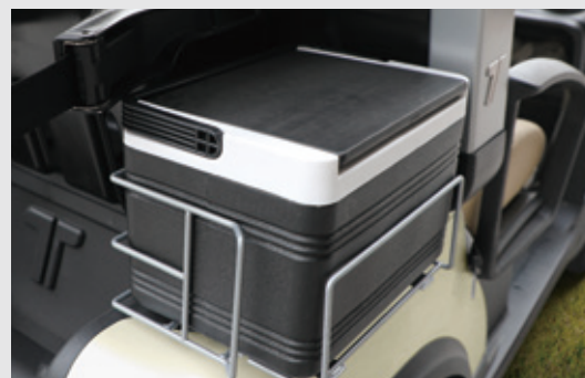
Caddy Master Cooler