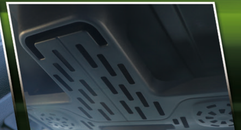
OVERHEAD STORAGE COMPARTMENT