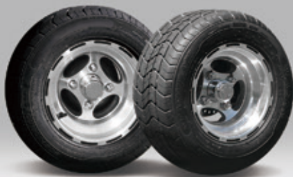
10" ALUMINUM WHEEL 205/50-10 TIRE