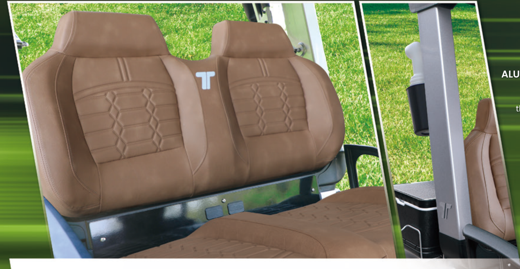
ALUMINUM CANOPY SUPPORTS

Tara features an ultra-strong and lightweight chassis, complemented by a lightweight lithium battery pack. This combination offers a light and nimble driving experience, allowing it to glide effortlessly across the course with grace.