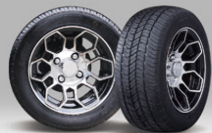
12" ALUMINUM WHEEL 205/50R12 RADIAL TIRE