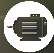
AC Induction Motor