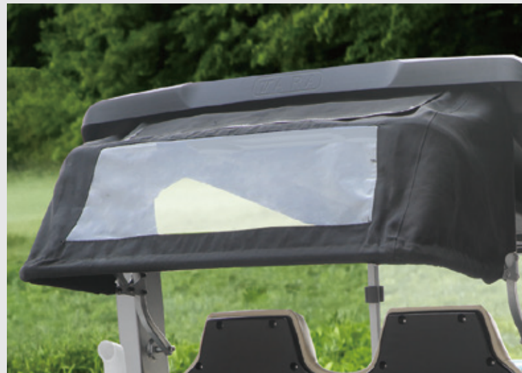
Retractable Golf Bag Cover