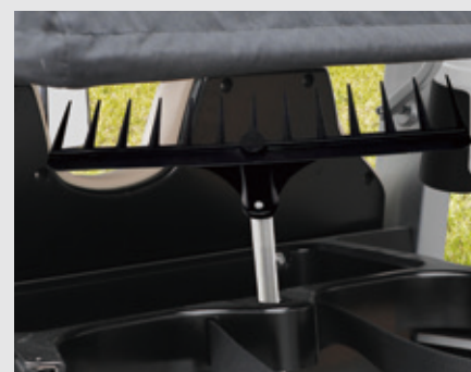
Rake Holder (Rake not included)