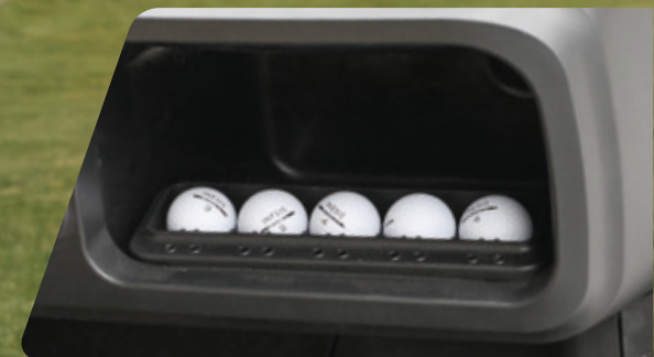
STORAGE COMPARTMENT WITH GOLF BALL HOLDER