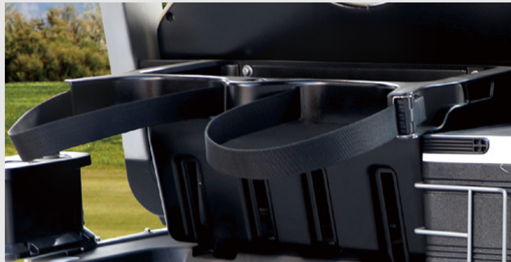
Golf Bag Holder

TARA features sleek, flowing contours, customizable in your choice of premium materials to suit your style or enhance the interior. It offers a wide array of add-on accessories for both golfing and personal use.